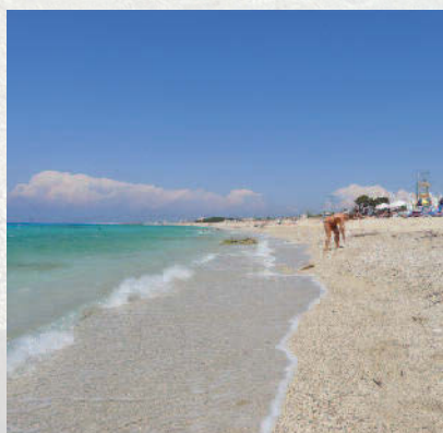
Agios Ioannis beach