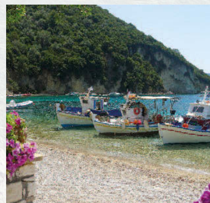
Dessimi Beach, Geni